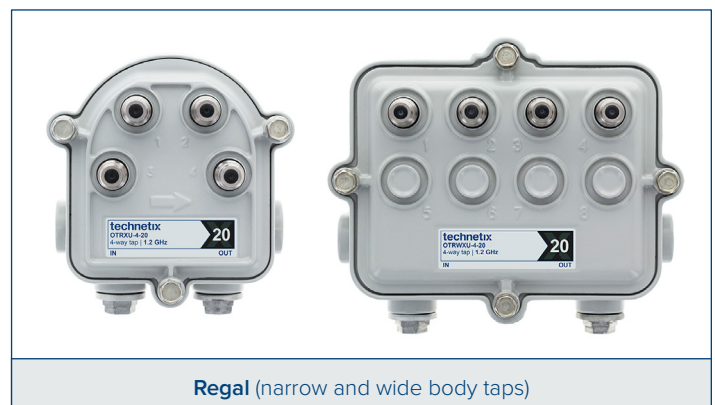
Regal (narrow and wide body taps)