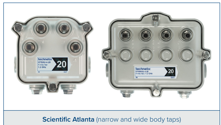
Scientific Atlanta (narrow and wide body taps)